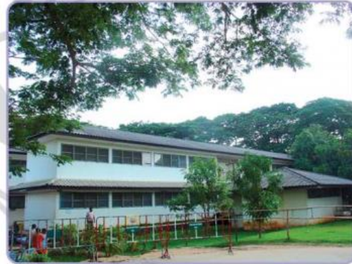
One of four buildings of the house for patients' relatives