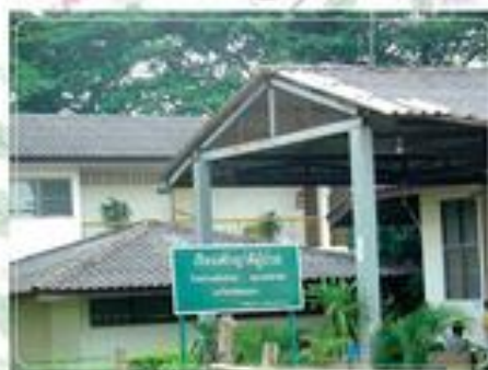
House for patients' relatives at Srinagarind Hospital, Faculty of Medicine, Khon Kaen University